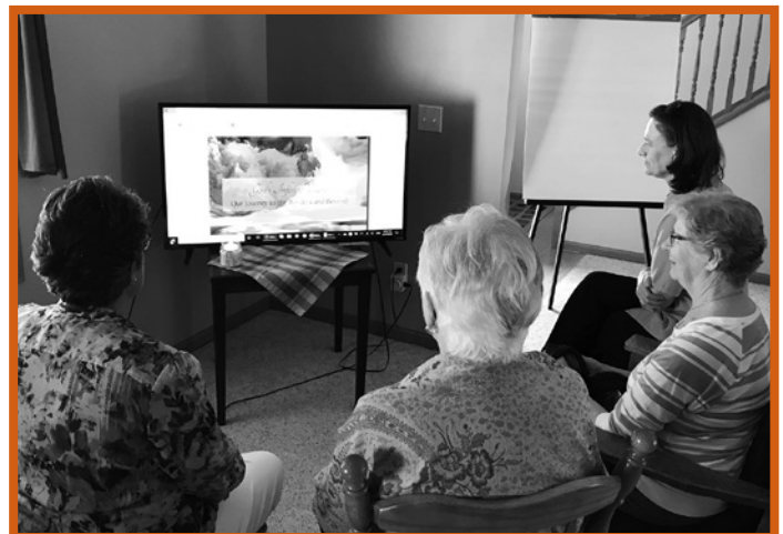
The congregational leadership team gathers during the Leadership Conference of Women Religious (LCWR) in August. Due to COVID-19, the conference was virtual offering both advantages and challenges.