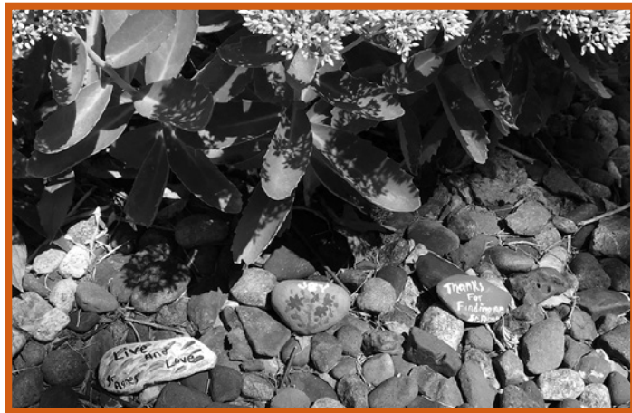
Rocks were painted with names of the sisters in the Nagle Center infirmary and placed outside in the courtyard for sisters and employees to find and remember that sister in thought and prayer.