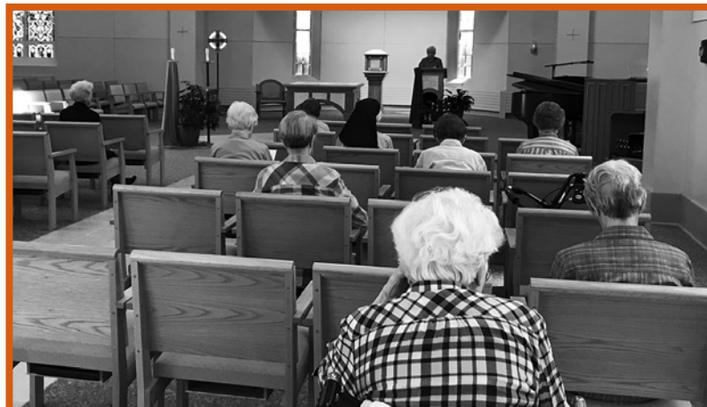
Daily, sisters gather in Sacred Heart Chapel to pray a litany for all those affected by COVID-19.