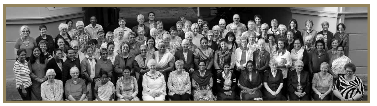
Participants of the Seventh Assembly of the International Presentation Association.

I experienced that our diversity is a great gift. I had the privilege of doing the work of the assembly at a table with Presentation people from Australia, India, Philippines and an Irish sister living in Ecuador. We learned so much from listening deeply to the truth and experience that each offered. When faced with confusion or disagreement, we asked questions with curiosity. We prayed in union with one another and all the people in our home countries. I wonder what kinds of divisions could be healed and insights gained if more of us sat around such a diverse table more often.