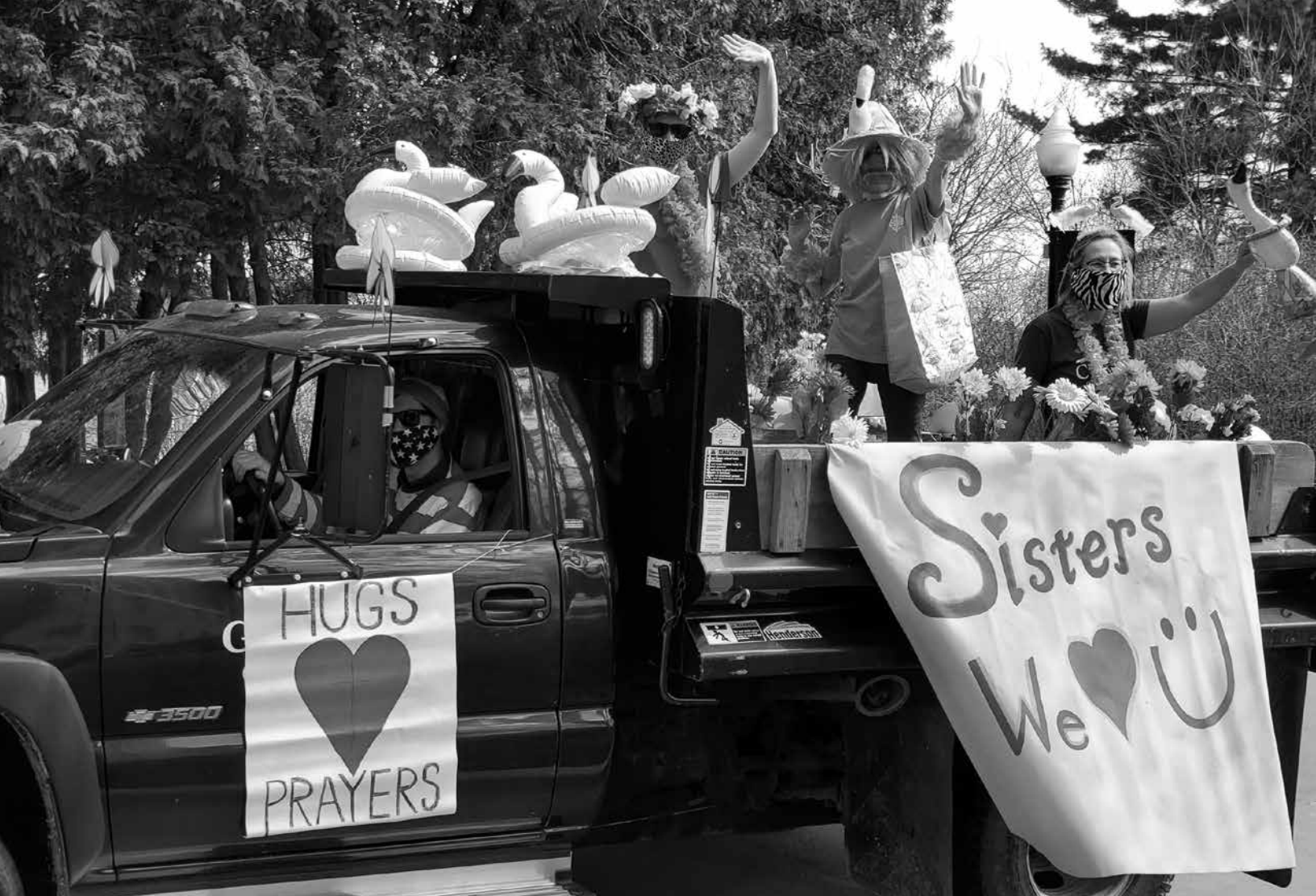
Presentation associates, employees and friends visit the sisters “parade-style” sending them love and prayers while practicing social distancing in their cars.