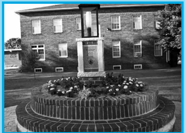
Presentation Park in Farley, Iowa.