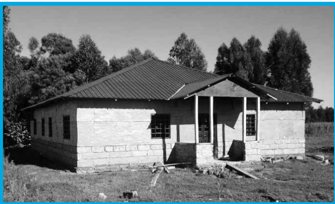
Community Learning Center in Kinangpop, Kenya

Consequently, the Presentation Mission Service Award was used to complete the inside of the center, including the installment of the ceiling, the flooring and plastering, the wiring for electricity, the rainwater collection gutter and so much more! The Community Learning Center now has a communal meeting hall, a computer room, a kitchen and dining room and a library. Currently, women and children are greatly benefiting from the center in numerous ways.