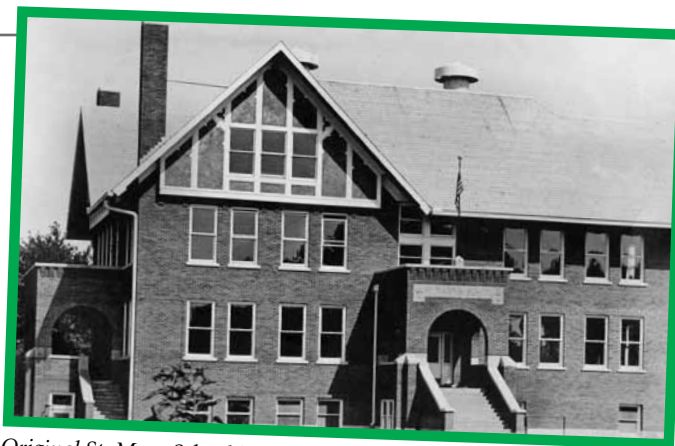
Original St. Mary School in Humboldt, Iowa