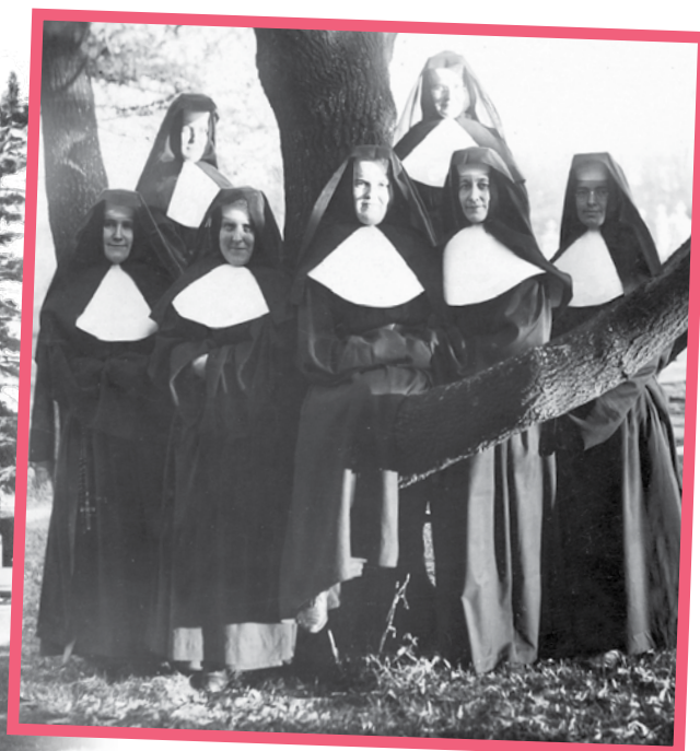
Left photo: Our Lady of Mt. Carmel School in Lawler before the fire in 1963. Top photo: Sisters who taught in Lawler in 1915.

Difficult times in the early days of the parish gave rise to the tradition of generosity toward the sisters. Every fall parish members went door to door collecting potatoes, meat, vegetables, lard, wood, money, anything to supplement the meager supplies at the convent. This tradition of giving extended into the better years when Presentation Day became the occasion for bringing gifts to the convent.