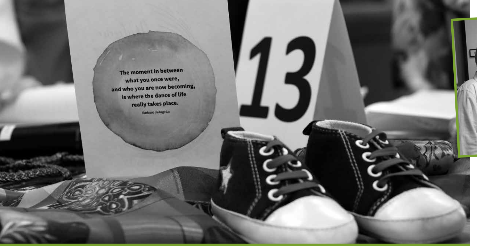
This year's community gathering centered around the theme of welcoming the dance and how the beauty of dance is much like the movement of community living. "Dance isn't well rehearsed, polished, or perfect; it slips and slides, sometimes innovative and shocking and at other times just exhilarant, but it's always real." (John Fisher)