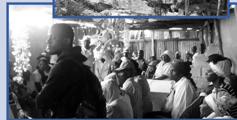
Left to right: Top and middle photo: Beginning foundation of new church/school/clinic at Soliette in Haiti. The new building is being built around the original building. Bottom photo: People of Soliette wait to see the doctor inside the old Our Lady of Grace Church and clinic.

much larger and stronger this structure will be compared to the original. In the end, not only will there be a new church/school/clinic building, but the project also will have provided income and work for the local people.