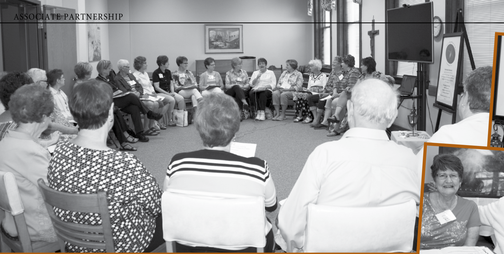
Associates participate in large group discussion during the associate break-out session during Community Days 2016.