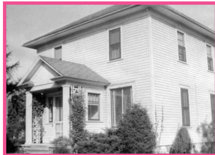
Sacred Heart Convent in Osage, Iowa, in the Fall of 1947