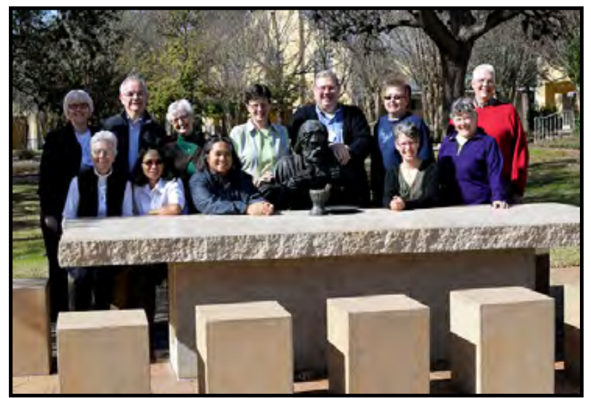
ForMission Class of 2018 and Team gathered at the Last Supper picnic table.